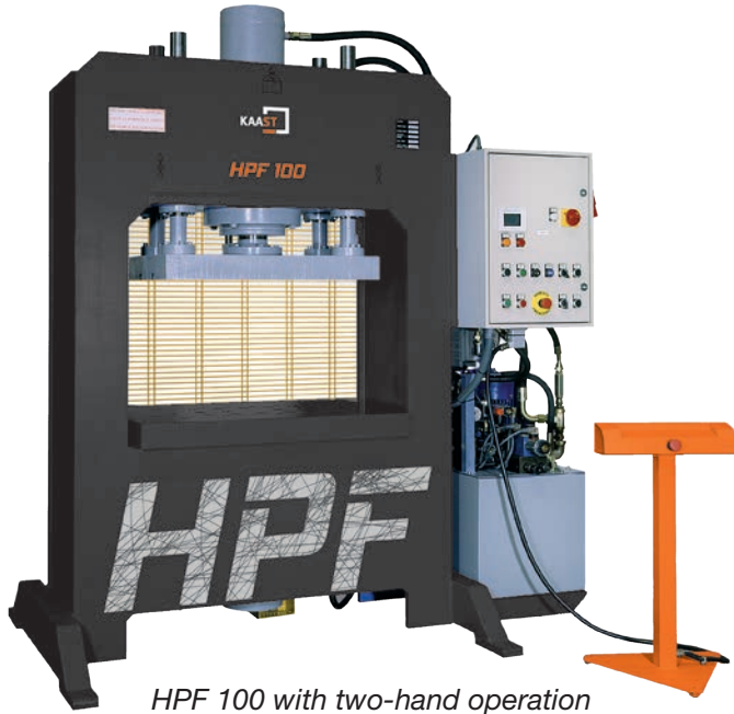
HPF 100 with two-hand operation

Hydraulic press for bending, punching and compression molding